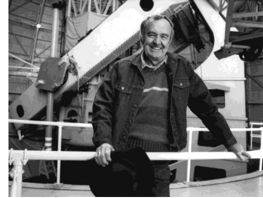
Allan R. Sandage (1926 – 2010)

Recipient of: National Medal of Science & Bruce Medal